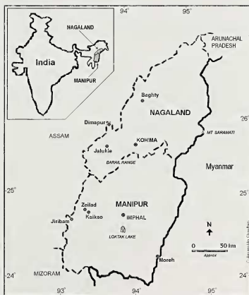
Fig. 1: Map of Manipur and Nagaland showing the areas surveyed

Tropical wet evergreen, semi-evergreen and tropical moist deciduous forests occur in patches in the lower and middle elevations. In the higher hills, subtropical broadleaf (evergreen) forest occurs with small areas of conifers in the eastern areas. Higher up on Saramati, temperate broadleaf forest is found, while atop (Mt. Saramati) the vegetation type is subalpine. During winter, the peak remains under snow. In the abandoned jhum (slash-and-burn shifting cultivation of the hill tribes), various grasses occur till these are colonized by scrubs and then shrubs. It may be mentioned here that the jhum has greatly altered the original vegetation types all over